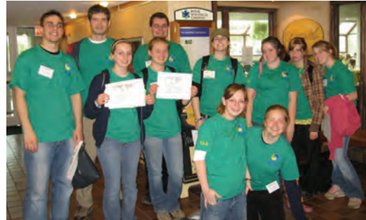
Local high school Environmental Club with their volunteer certificates

Over the last 11 years almost 30,000 students have taken part in the Earth Day Hamilton Eco-Festival. It is one of the largest Earth Day celebrations in Canada. The Eco-Festival is organized by a volunteer committee and a part-time paid coordinator and depends on its army of volunteers to make this day a success. A group of enthusiastic student volunteers and teachers from a local High School made wonderful role models for the grade 4,5,6 elementary students attending the event.